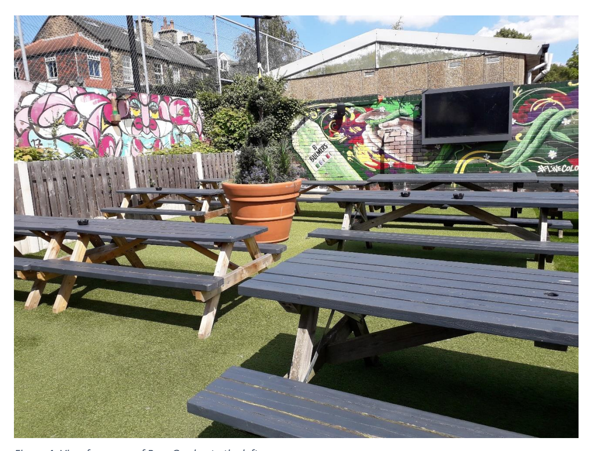
Figure 4: View from rear of Beer Garden to the left screen