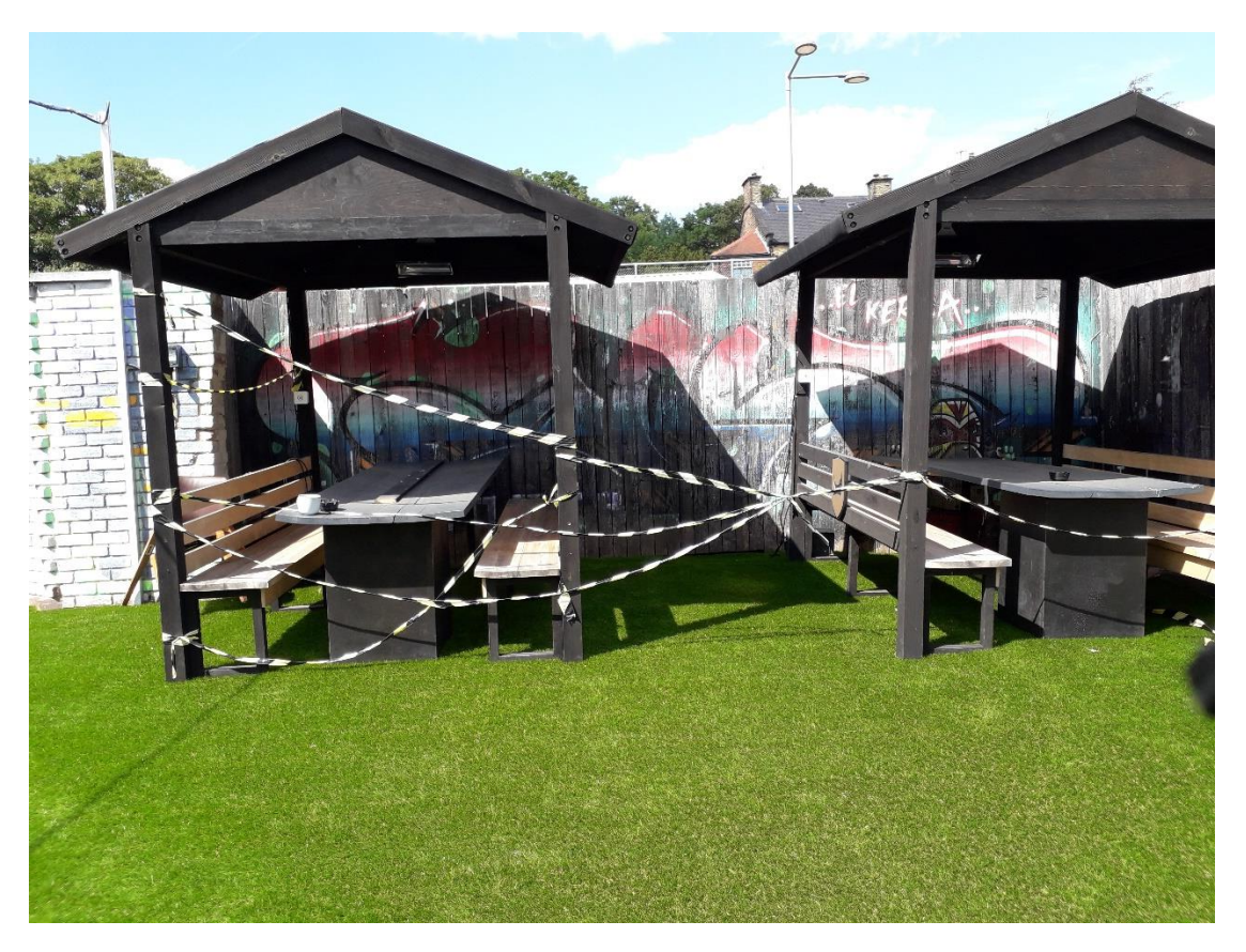
Figure 5: Part of proposed new seating area