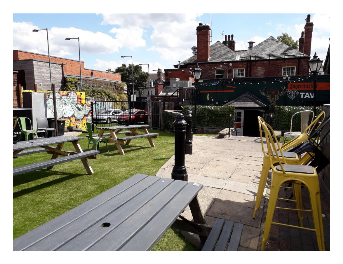
Figure 3: View of beer garden towards Nursery Tavern. The gates in the distance where cars are currently parked are shown on the plans to be removed and the additional seating extended to the side of the building.