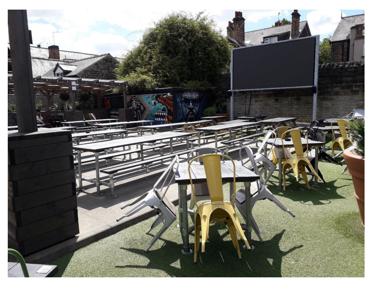
Figure 1: View from rear of beer garden to the right screen