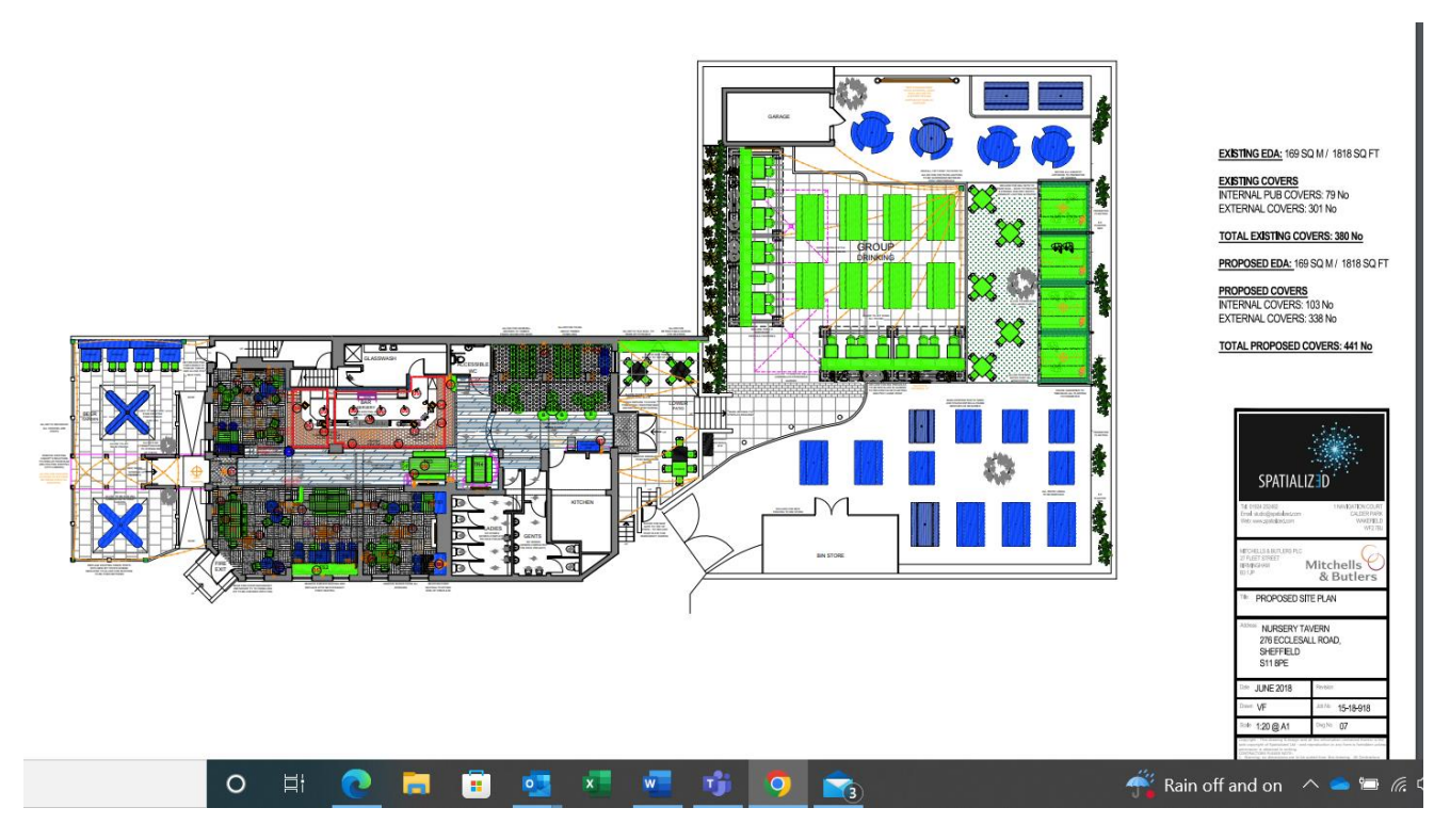
Site Plan Scan Date 03 Oct 2018

18/03728/FUL | Seating huts and additional outdoor seating to rear and erection of large TV screen to rear beer garden (amended description) | Nursery Tavern 276 Ecclesall Road Sheffield S11 8PE